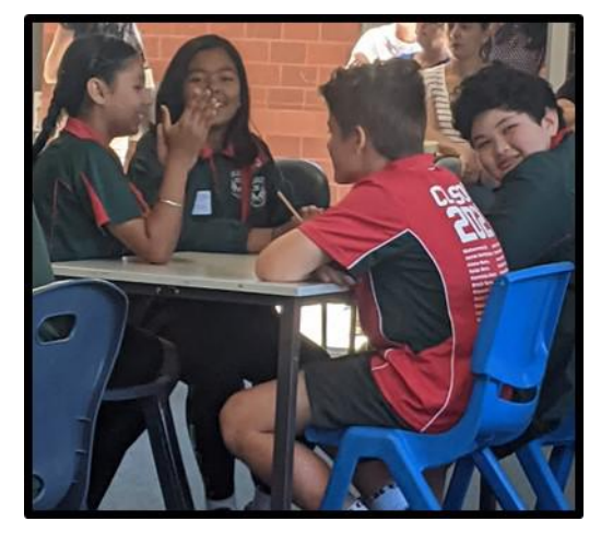
The Belmay Brainiacs competing at the Grand Final