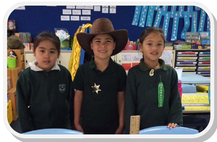
Happy Room 9 students set up their desks each morning, ready for the day's learning.