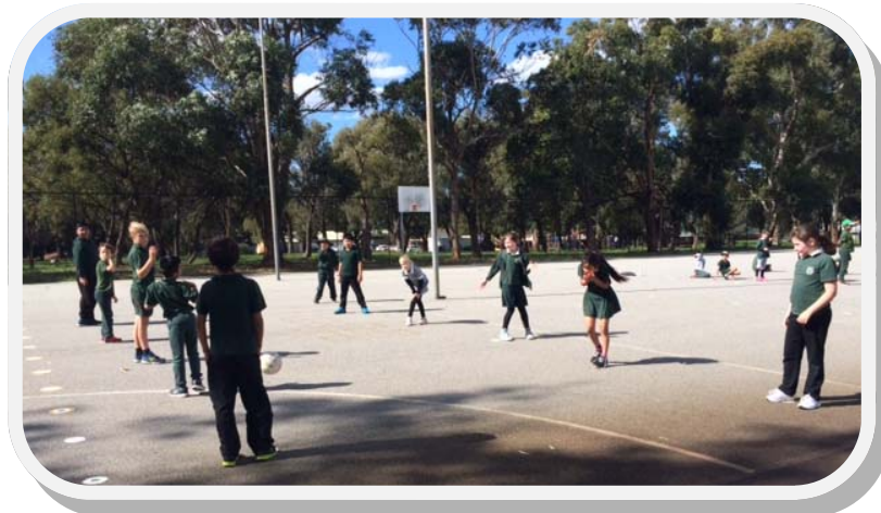
Skills practise for team games in Passball and Thread the Needle occurs each Friday in preparation for our Athletics Carnival next week.